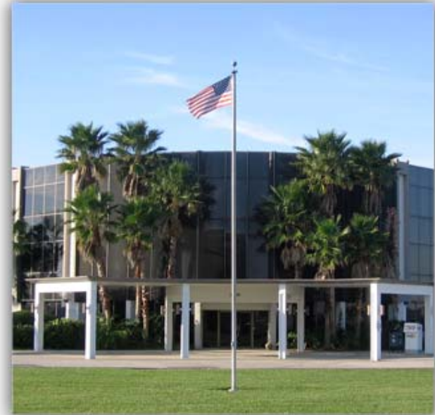
Jerue Headquarters, Lakeland, FL

Trusted for years. Accountable every day.™